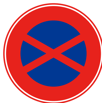
No Parking or Stopping